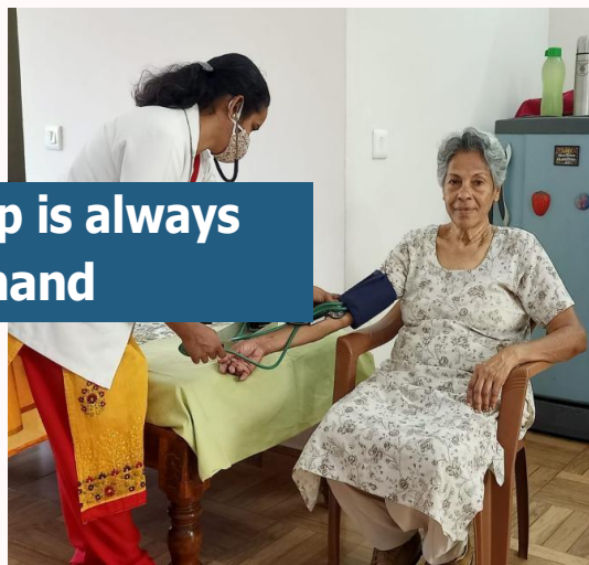
Help is always at hand

Ramps, stretcher ramps and lifts make it easy to move around the villa even with a wheelchair!