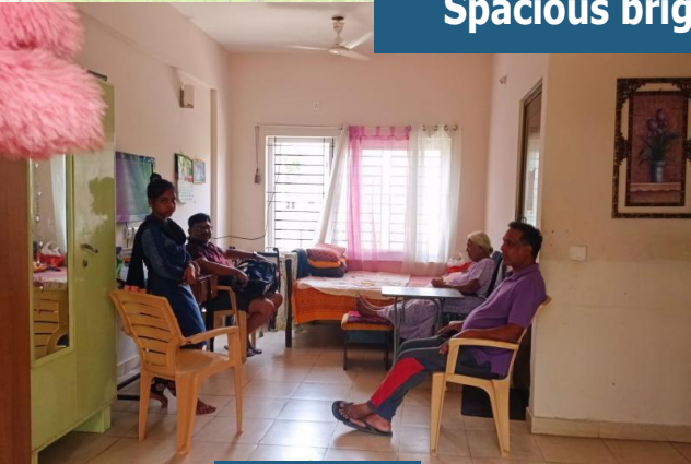
Spacious bright rooms

Other facilities include: laundry service, basement parking, chapel