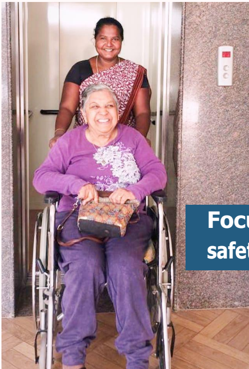
Focused on safety and ease

Every room opens into a veranda overlooking the central garden . A great way to start the morning or a conversation with your neighbors!